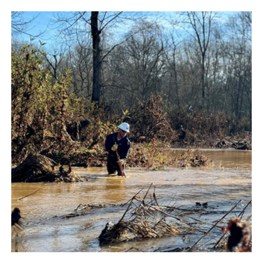
Spring is here, flood season is near Reach: 4.5k